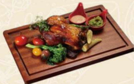
特色风味啤酒烤春鸡 Pollo Borracho

扒烤啤酒腌制春鸡，配自制辛香料，扒烤蔬菜，拉法饼和墨西哥莎莎酱 Grilled chicken marinated with beer and house spices; served with grilled vegetables, guacamole, lafa bread and molcajete salsa