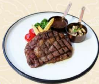
眼肉牛排 Rib Eye Steak

300g碳烤澳洲谷饲眼肉牛排烤至理想熟度，配扒烤迷你西兰花，迷你玉米笋，烤番茄，黑椒汁 300G Australian rib eye steak grilled to your preference, with grilled broccolini, baby corn, tomatoes, black pepper sauce