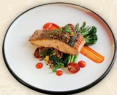
三文鱼排 Salmon Steak

附赠一份软饮、咖啡或者茶 INCLUDES 1 SOFT DRINK, COFFEE OR TEA