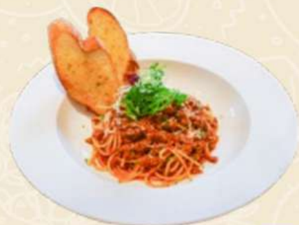
意大利肉酱面 Spaghetti Bolognese

风味浓郁意大利肉酱混合直身意面 A rich beef and tomato bolognese sauce tossed with spaghetti