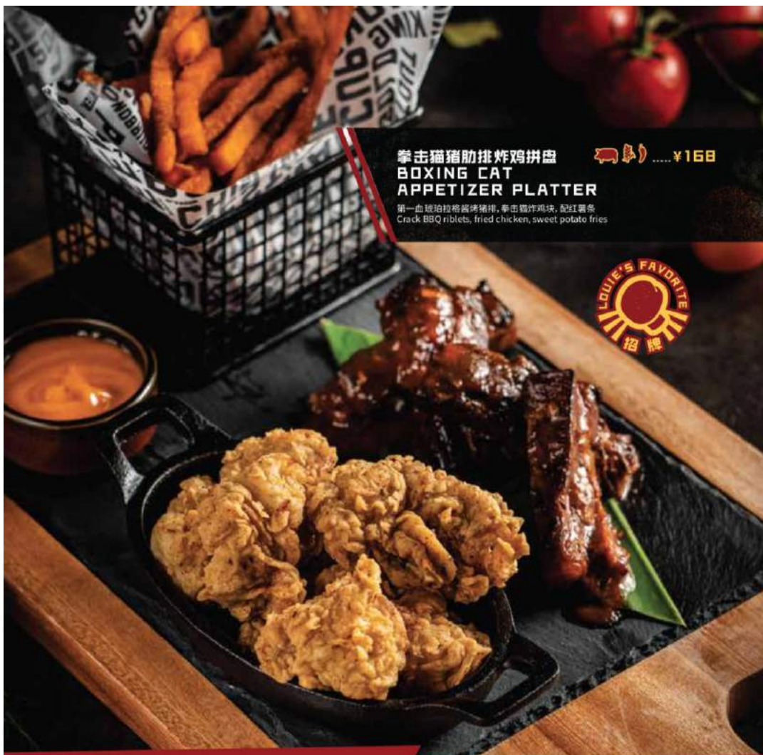
拳击猫猪肋排炸鸡拼盘 BOXING CAT APPETIZER PLATTER 第一血琥珀拉格酱烤猪排, 拳击猫炸鸡块, 配红薯条 Crack BBQ ribslets, fried chicken, sweet potato fries