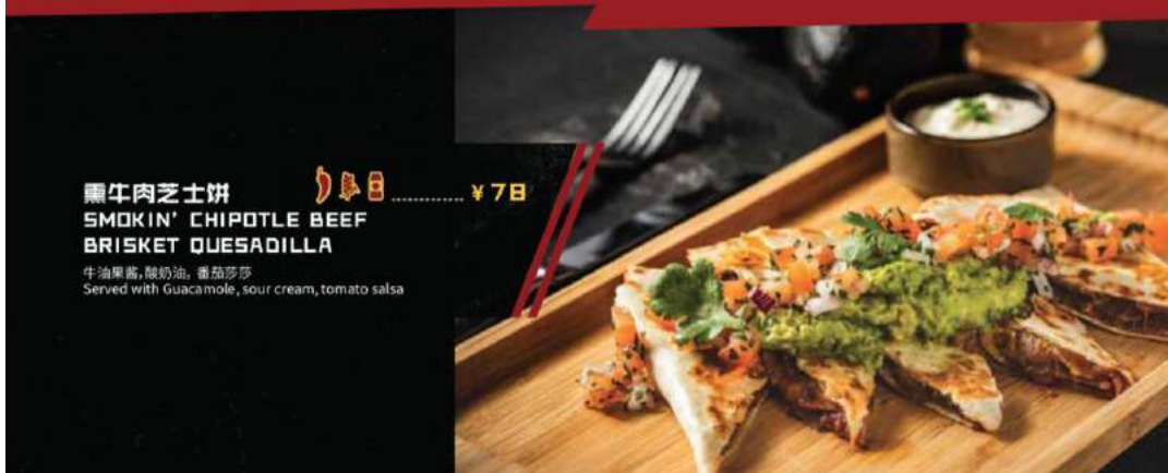
熏牛肉芝士饼 SMOKIN' CHIPOTLE BEEF BRISKET QUESADILLA 牛油果酱, 酸奶油, 番茄莎莎 Served with Guacamole, sour cream, tomato salsa