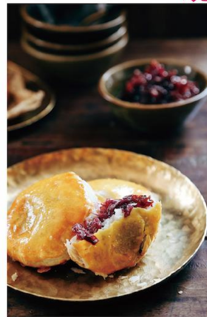
Handmade Cake Filled with Rose Jam