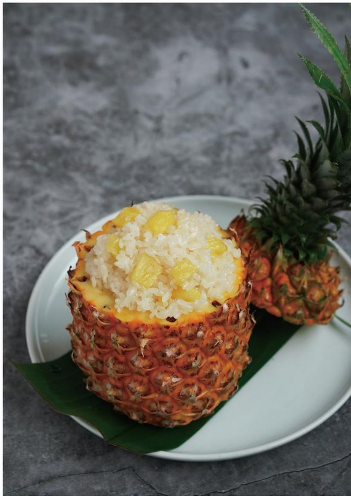
Dai-style Pineapple Rice