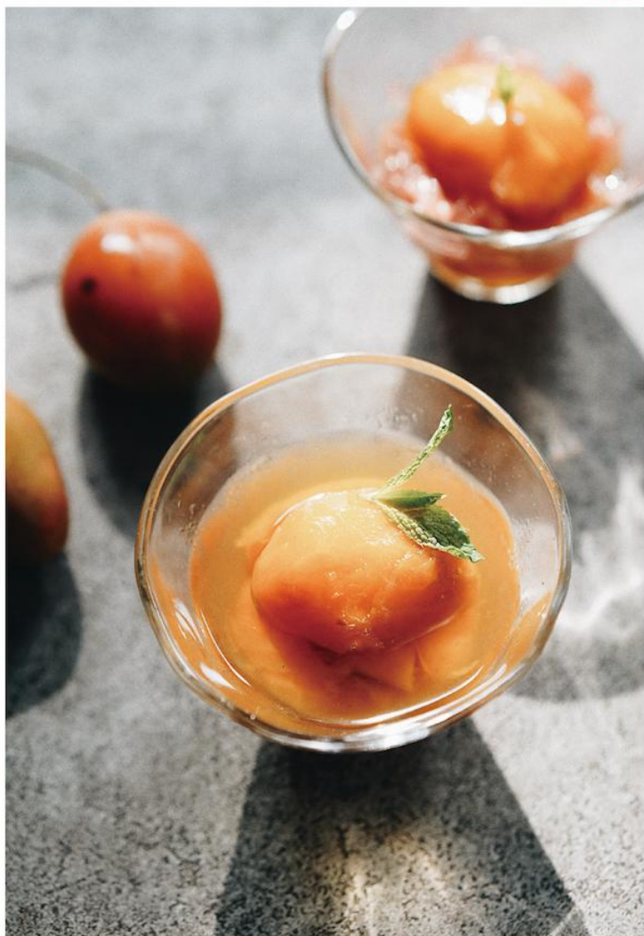
Sour Plum with Cyphomandra Betacea Sendt.