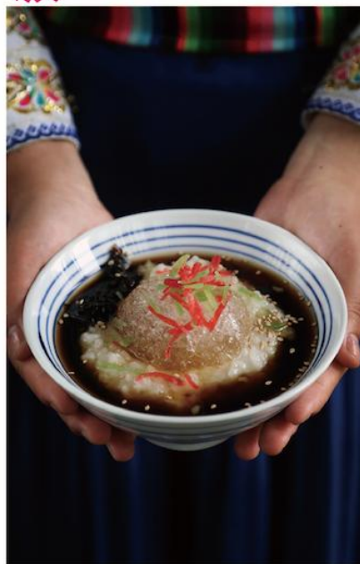
Yuxi Ice Glutinous Rice Congee