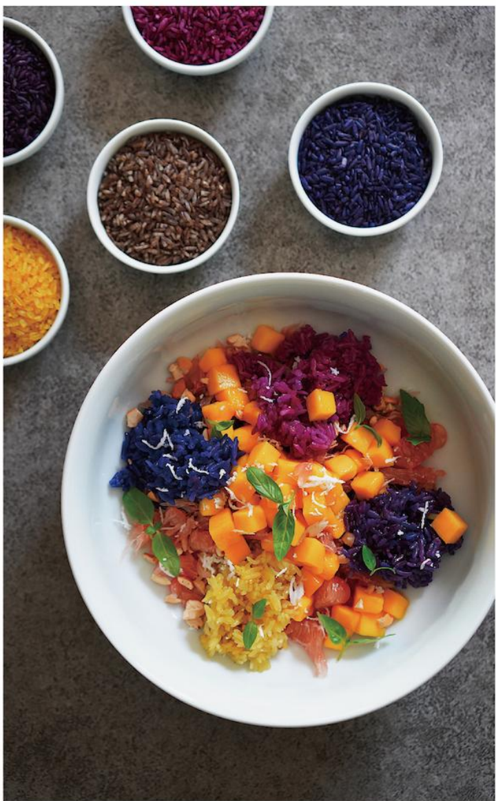
Pingbian Dyed Rice Salad