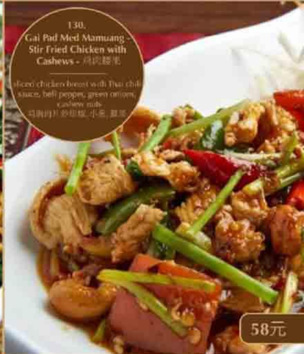
130. Gai Pad Med Mamuang - Stir Fried Chicken with Cashews - 鸡肉腰果 sliced chicken breast with Thai chili sauce, bell pepper, green onions, cashew nuts 马胸肉片炒印城, 小米, 腰果