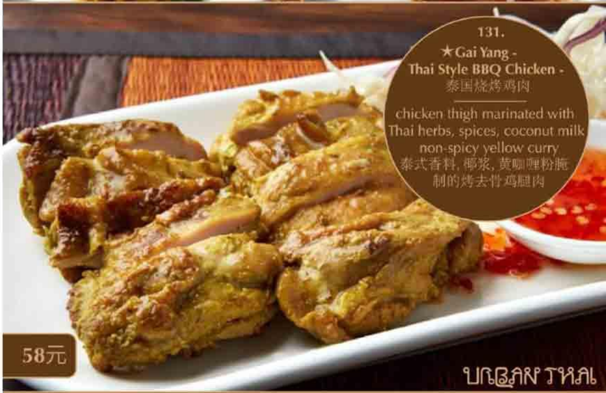
131. ★ Gai Yang - Thai Style BBQ Chicken - 泰国烧烤鸡肉 chicken thigh marinated with Thai herbs, spices, coconut milk non-spicy yellow curry 泰式香料, 椰浆, 黄咖喱粉腌 制的烤去骨鸡腿肉