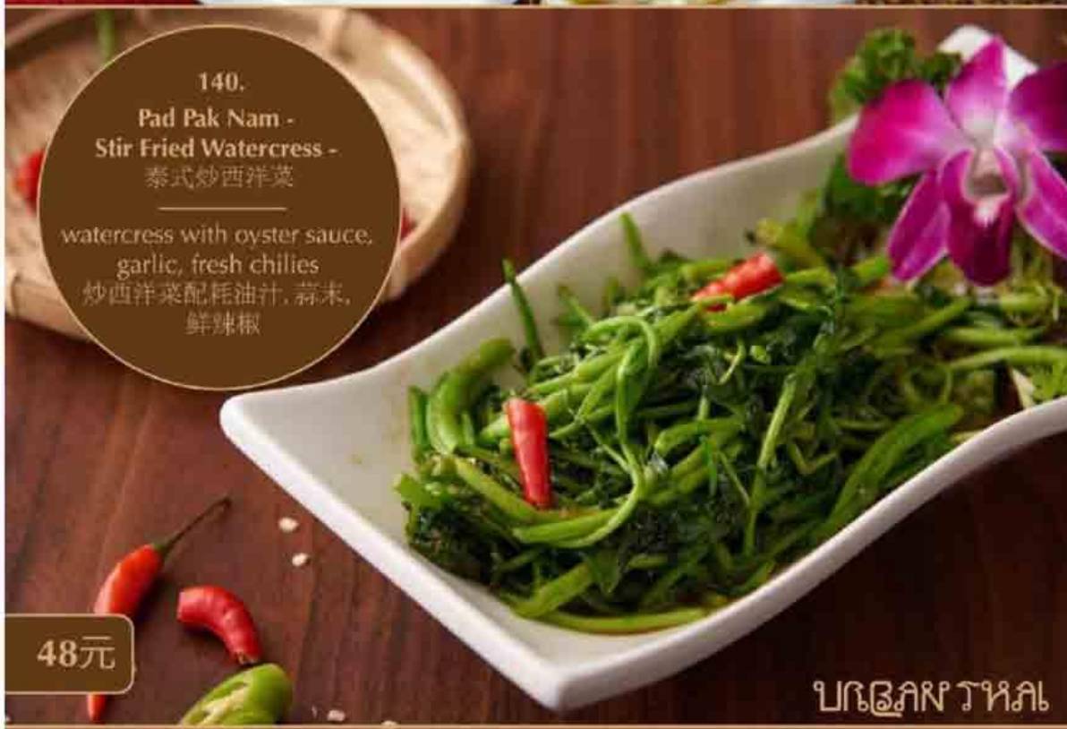
140. Pad Pak Nam - Stir Fried Watercress - 泰式炒西洋菜

broccoli, snow peas, cauliflower, straw mushrooms, baby corn 西兰花, 荷兰豆, 花菜, 香菇, 玉米笋