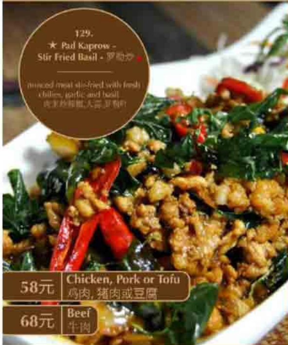
129. ★ Pad Kaprow - Stir Fried Basil - 罗勒炒 minced meat stir-fried with fresh chilies, garlic and basil. 肉末炒罗勒大蒜罗勒叶