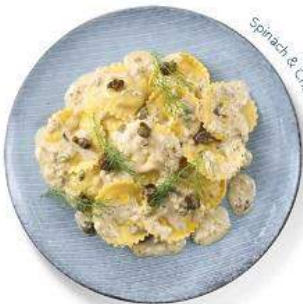
Spinach & Cheese Ravioli