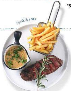
Steak & Fries

One set per person No service charge www.o-delice.com #o.delice CódiceRestaurants