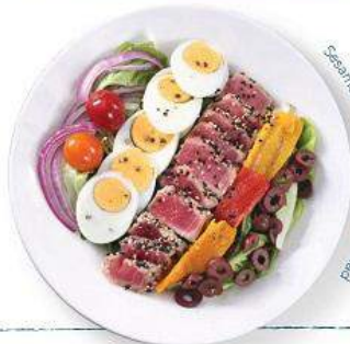
Sesame-Crusted Tuna Niçoise Salad