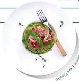
Parma Ham & Sweet Peas Risotto