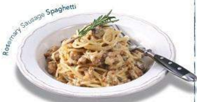
Rosemary Sausage Spaghetti