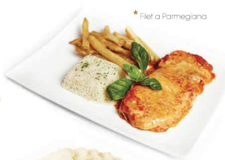
* Filet a Parmegiana