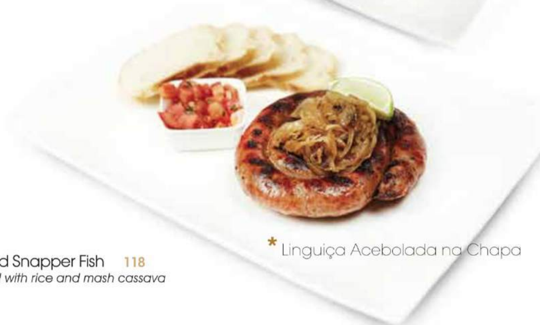
* Linguiça Acebolada na Chapa