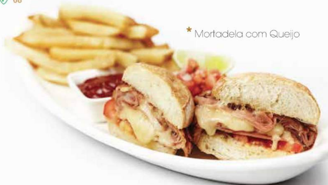
* Mortadela com Queijo

(All served with French fries or Tomato Salad) 所有的三明治都配有炸薯条或番茄沙沙