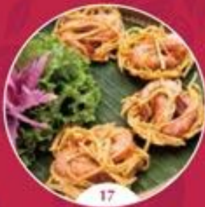
17. 西湖虾饼 West Lake Prawn Cakes Bánh tôm Hồ Tây