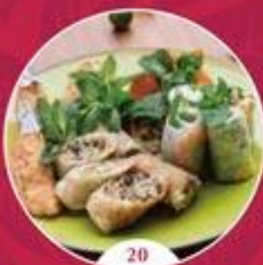
20. 越式开胃套餐春卷★★ Mix Plate Appetizer