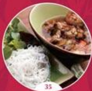
35. 越式碳烤猪肉捞檬 Hanoi Noodle w/ Pork Paste Bún Chả Hà Nội