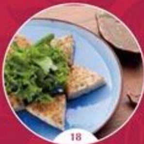
18. 越式煎鱼饼 Vietnamese Fish Cakes Chả Cá Quy Nhơn