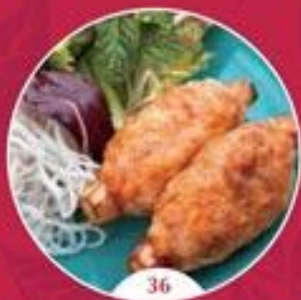
36. 越式甘蔗虾 Sugarcane Shrimp Paste Chạo Tôm