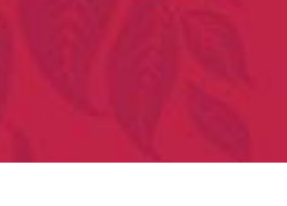
85. 越式炒时蔬 Stir Fried Vegetables Rau Xào Thập Cẩm