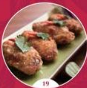
19. 越式黄油煎鸡翅 (4块) Chicken Wings w/ Butter (4 pieces) Cánh Gà Chiên Bơ (4 pieces)