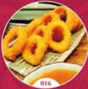
016. 鱿鱼圈 (New) Squid Ring Mực Chiên Giòn