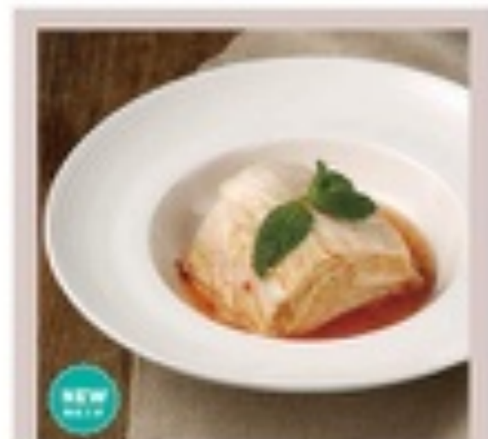
自制辣白菜 15 元 SELF-MADE SPICY CABBAGE

原料：西兰花、胡萝卜、圣女果 Mint, Cucumber, Carrot, Cherry Tomato