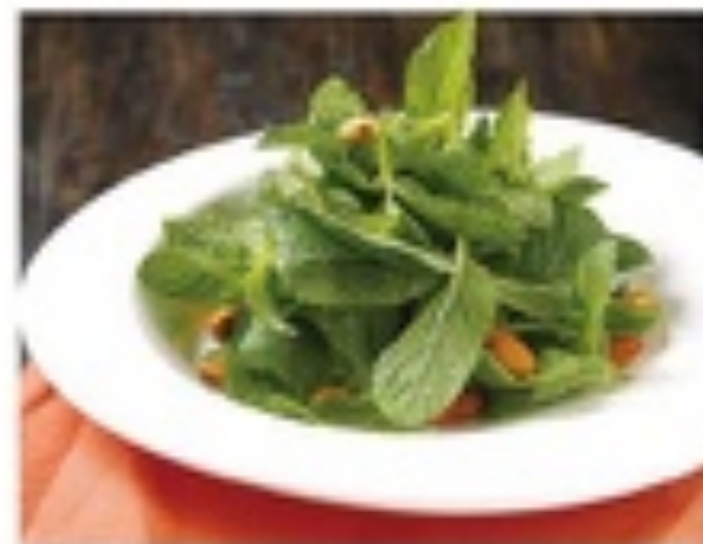
噬一个前菜 29 元 MINT WITH BADAM