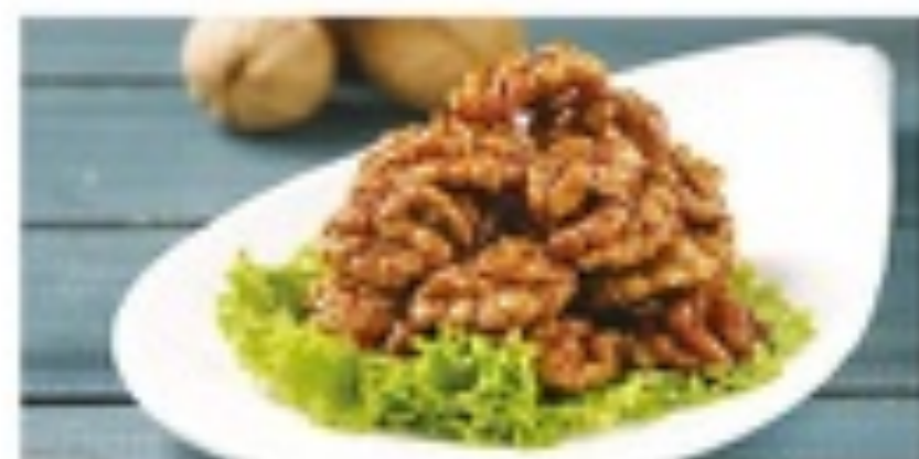
琥珀桃仁 32 元 WALNUT WITH SESAME