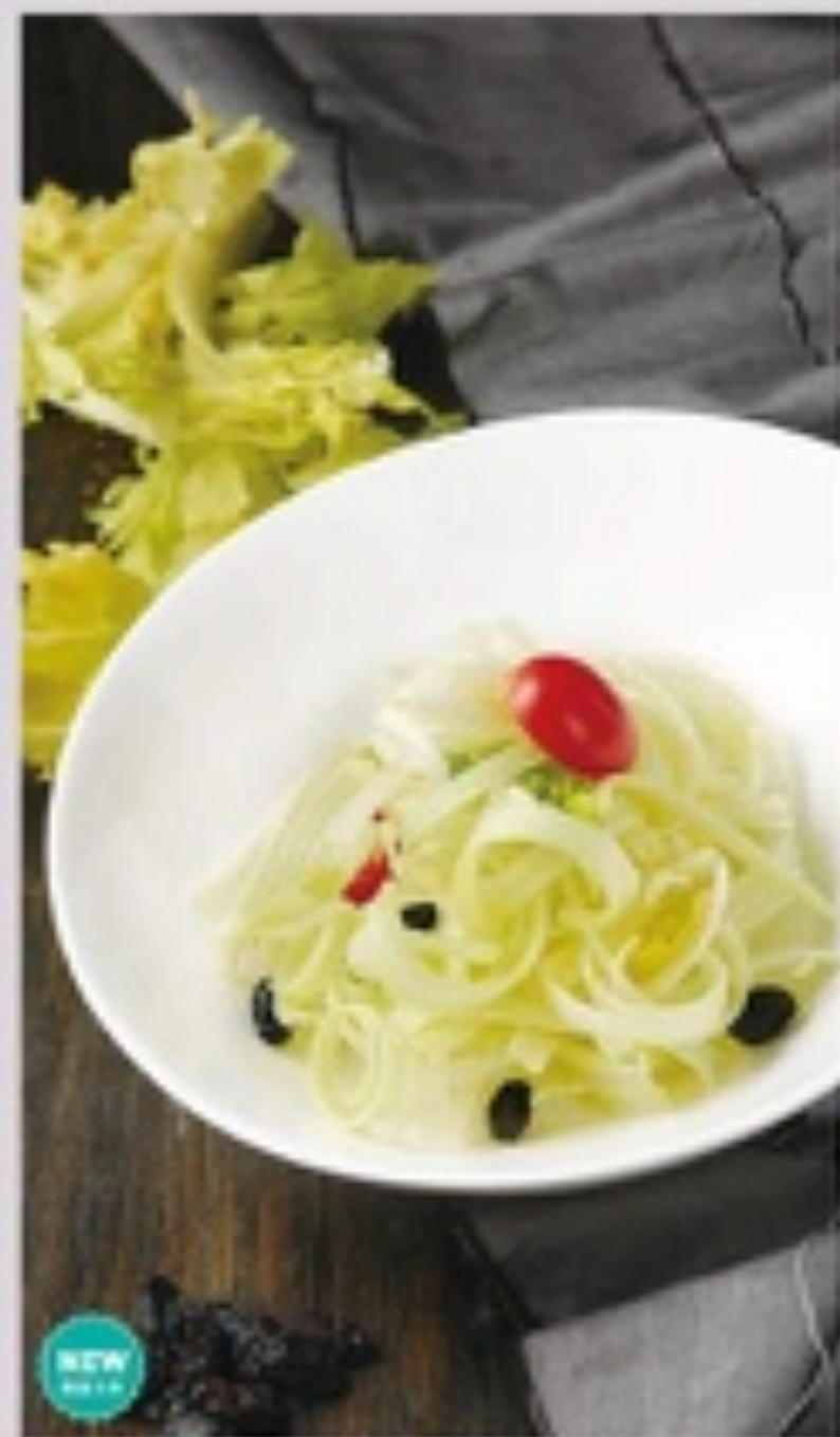
黑加仑拌香芹 18 元 MIXED CELERY WITH BLACK CURRANT