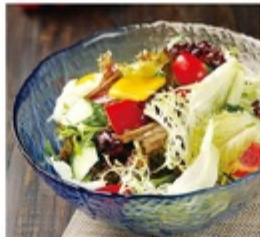
蔬菜大巴扎 38 元 VEGETABLE SALAD

原料：西兰花、胡萝卜、圣女果 Mint, Cucumber, Carrot, Cherry Tomato