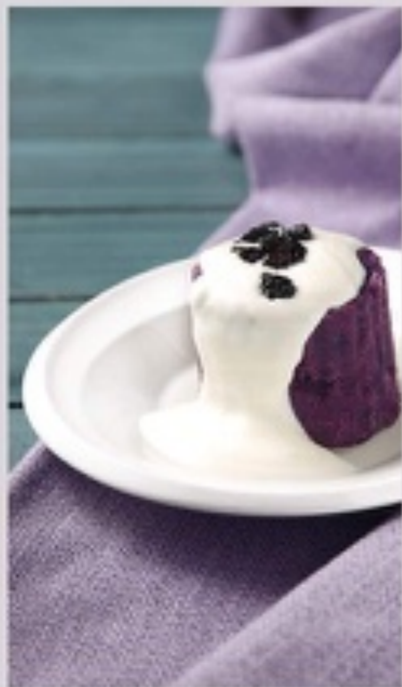
酸奶紫薯泥 22 元 MASHED PURPLE POTATO WITH YOGURT